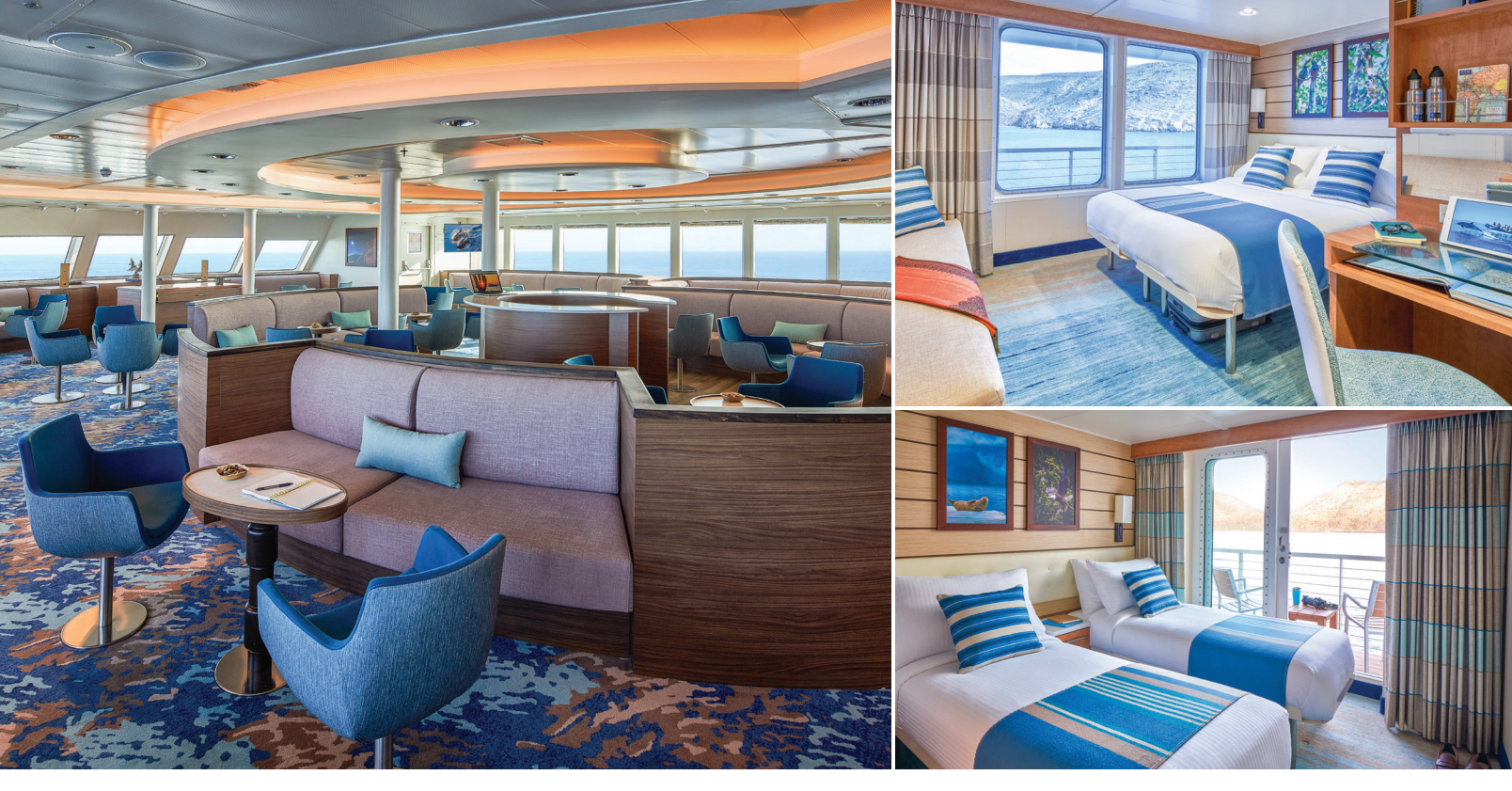
Clockwise above: the lounge, with 270° views, is the hub of the expedition community; Category 5 cabin is our most spacious; Category 4 cabin with single beds (which can be converted to queen) and private step-out balcony.

CATEGORY 1: Main Deck #301-306 Cabins face outside with two portholes, feature two single beds that can convert to a queen, a writing desk, two nightstands, full length mirror and a closet.