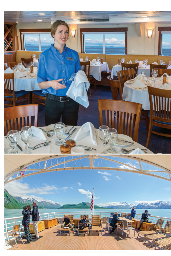
From top: Dinner is served in single seatings with unassigned tables for easy mingling; enjoy morning stretch class or afternoon wildlife viewing from the partially covered sun deck.

WELLNESS: The vessel is staffed by a wellness specialist and features exercise equipment, LEXspa and outdoor stretching area.