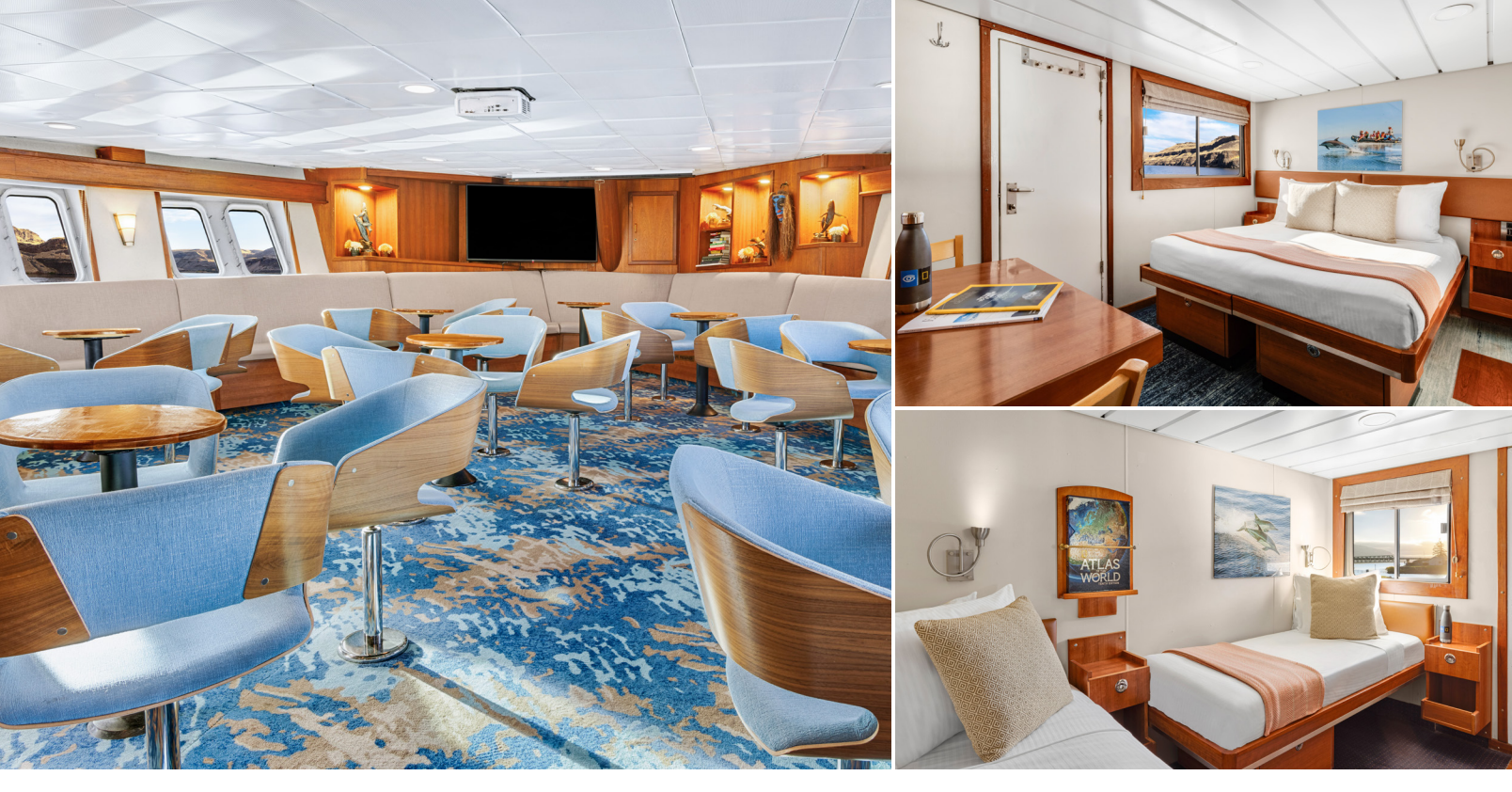
Clockwise from left: the lounge with expedition library and flatscreens for easy presentation viewing; single beds can be pushed together to form a queen in the four Category 3 cabins on the Upper Deck; a comfortable Category 2 cabin.

CATEGORY 1: Main Deck #300-305 Cabins face outside with a large view window, feature two single beds, two nightstands and a closet.