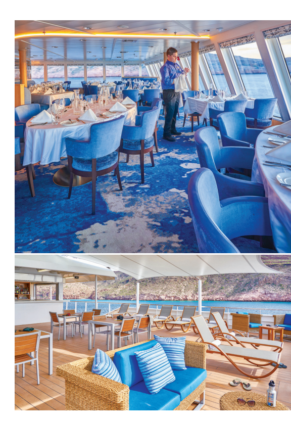
From top: Enjoy expansive views and regional fare in the informal dining room; gather to watch for wildlife or enjoy an evening cocktail with friends in the open air, partially covered sun deck.

WELLNESS: The vessel is staffed by a Wellness Specialist and features a gym with an elliptical machine, treadmill, exercycles, handweights and resistance bands. Treatments in the LEXspa are available by appointment.